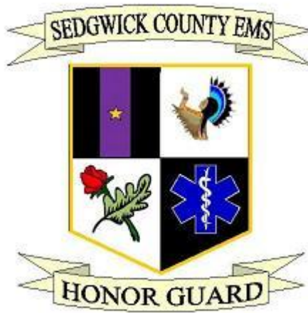
B. The official Sedgwick County EMS Honor Guard flag